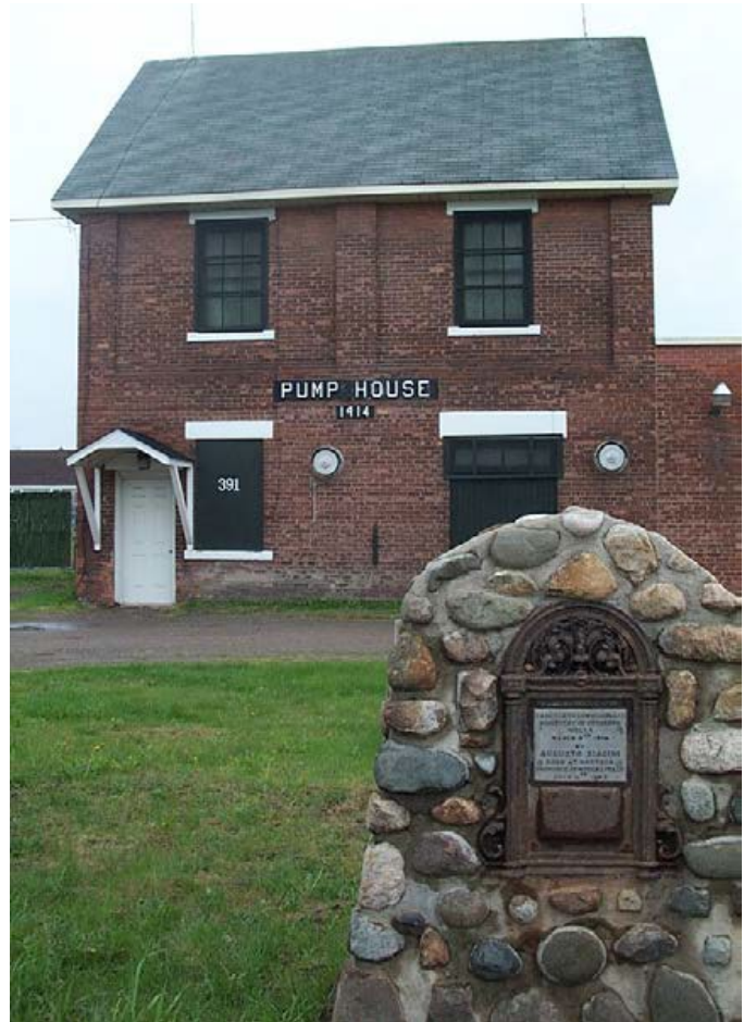
Steelton Pump House established 1914.