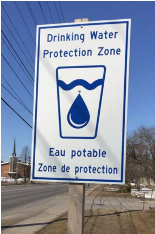
Steelton Well northeastern signage on Second Line West.